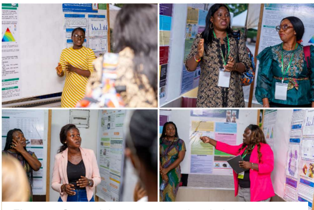
Figure 7: Some delegates presenting their posters

The conference received a total of thirty (30) abstract submissions, which were thoroughly reviewed by