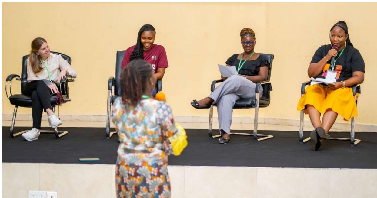
Figure 17: Breakout session recap

At the end of the session, each sub-group was given about two minutes to discuss which of the foods provided could be described by the selected attribute. After all 5 attributes were discussed, their sub-group leaders provided the foods that related to the attributes and the reason why they selected those foods.