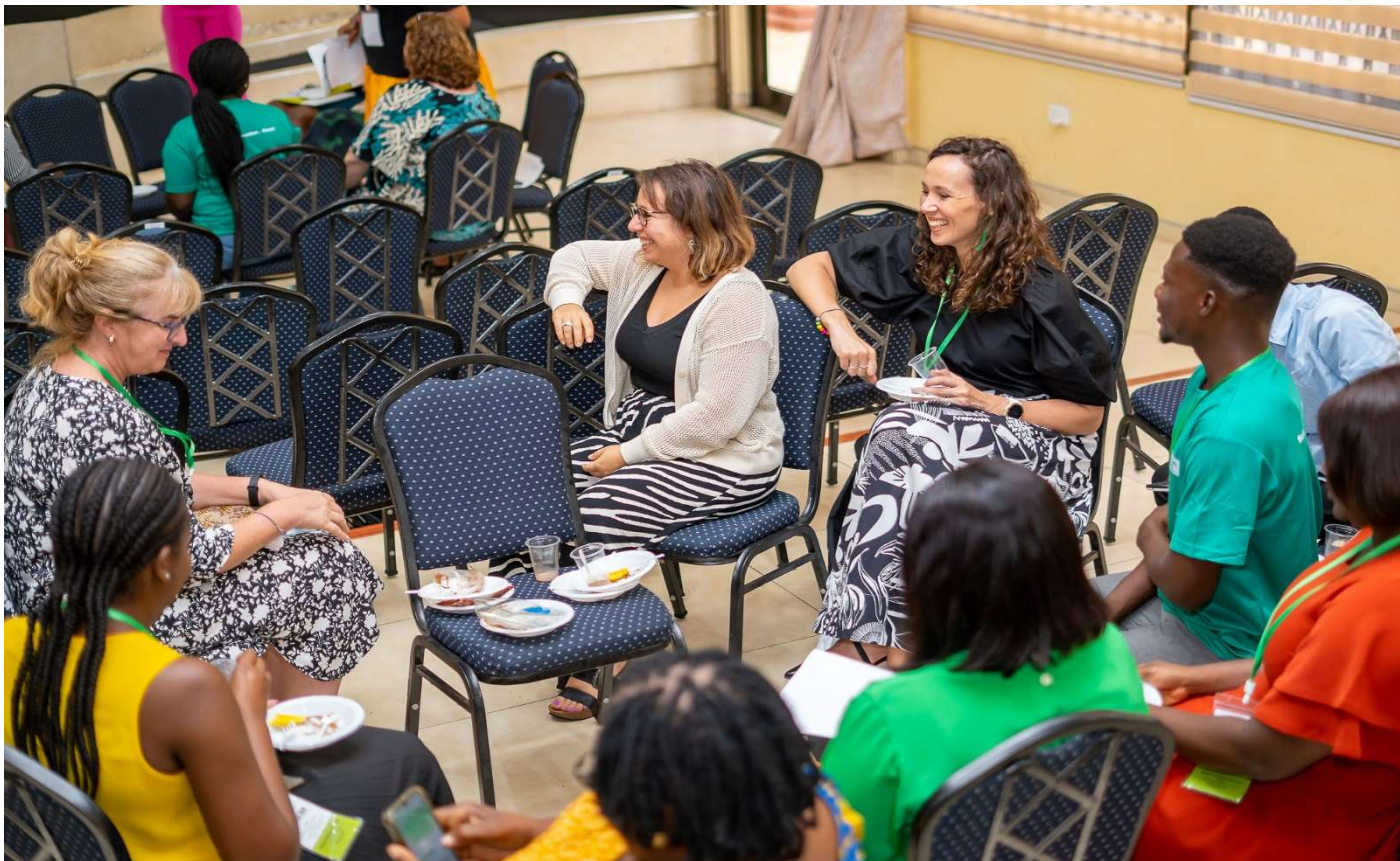
Figure 14: Some delegates during breakout session

Delegates participated two interactive working session.