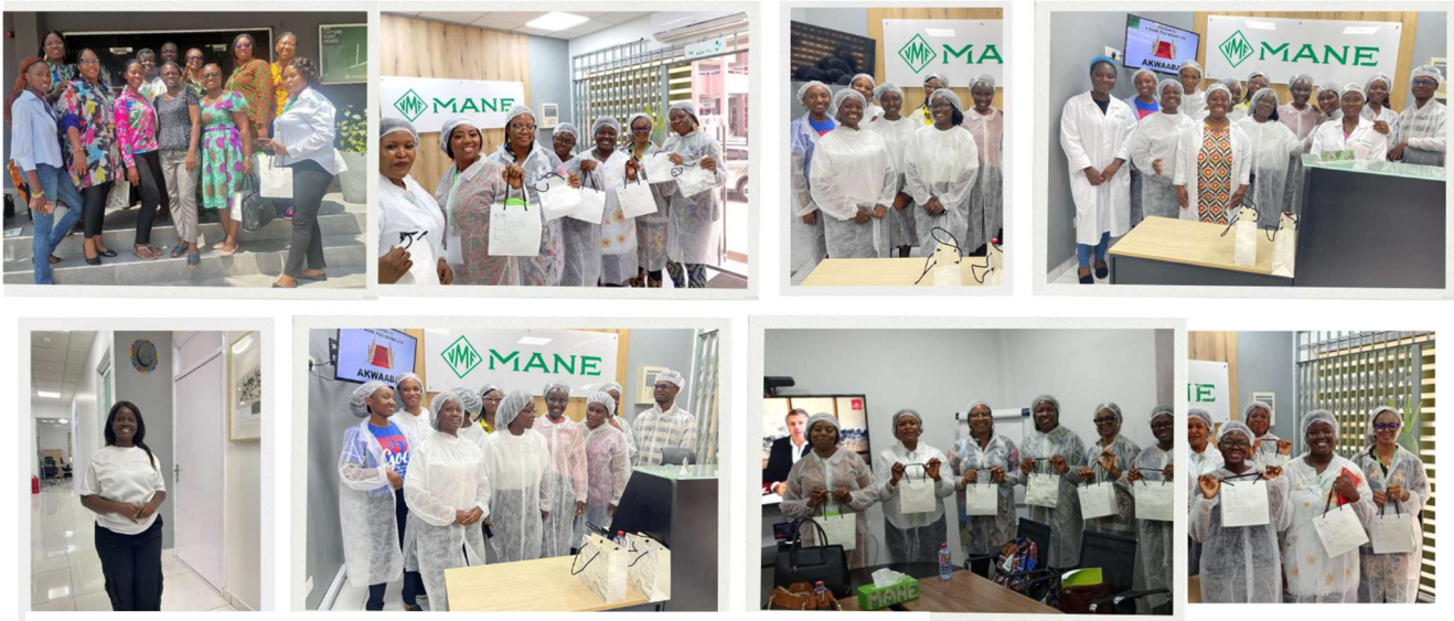
Figure 22: Some delegates at MANE Ghana Ltd.

The visit was attended by 17 delegates, 2 LOC members, and 3 volunteers.